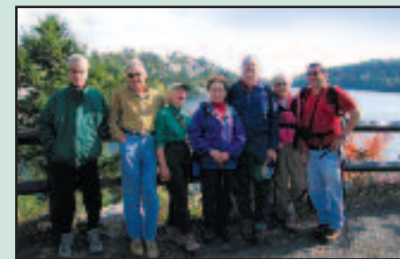
WTA hikers at Minnewaska.

In their own words: "We are local to the Westchester and the greater New York area, convenient to New York City. We are a friendly, welcoming group of varying ages and hiking interests. We usually meet at the parking lot of the North White Plains Train Station to carpool to the trail site. Give us a try!"