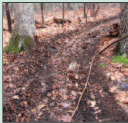
Four-wheelers create deep and widespread damage.