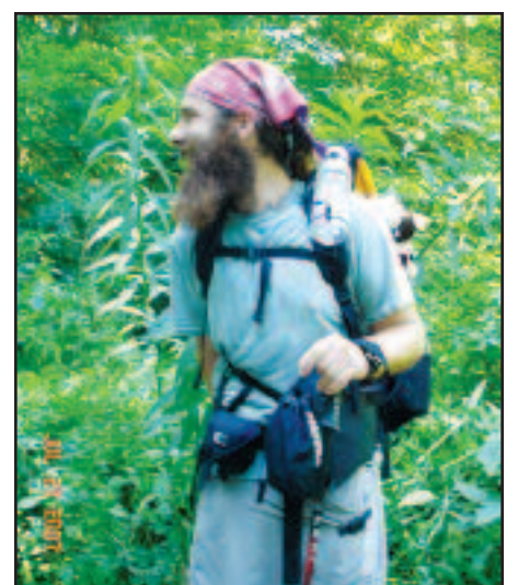
A thru-hiker stops to chat.

Check out the latest news on the club and the photo albums from past work parties; find us at www.nynjtc.org under Member Clubs (look for RPH).