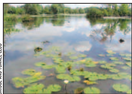
BRIDGE AND TUNNEL CLUB

Not far off the bright red line that marks the Long Path on the map for Schunemunk Mountain (West Hudson Trails, map 114), you'll see a small patch of wavy blue lines indicating "swamps and wetlands." Usually we hikers avoid wetlands. Yet they are among our most important ecosystems and can be quite interesting for their diversity.