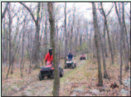
ATVs drive hikers off trails.

Most of those testifying supported S2055 and emphasized the need for enforcement to begin as soon as possible. Many also spoke in favor of crafting ATV park legislation that would allow such a park to be created someplace other than on current state park or forest land, which would be required by the original language of S1059.