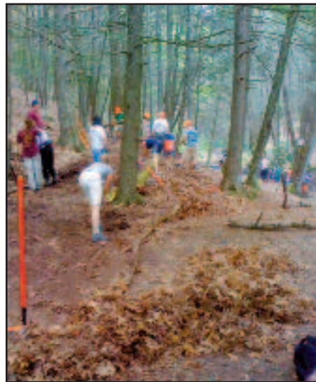
Mohican camp trail volunteers at work last season.