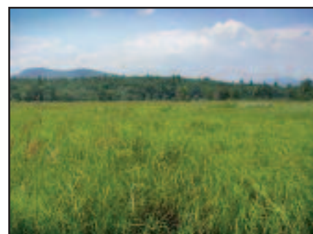
MAINE DEPARTMENT OF CONSERVATION