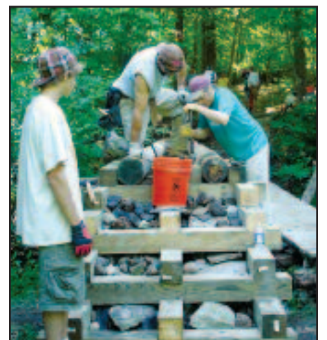
Volunteers work up an appetite.