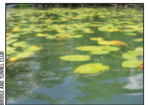
BRIDGE AND TUNNEL CLUB