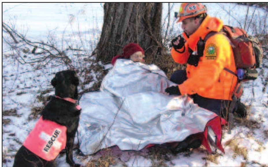
A NJ Search and Rescue K9 team aids a "victim" during a winter training exercise.