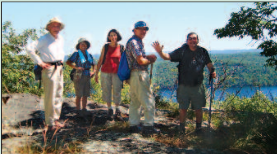
The Westchester-based club hikes throughout the region; above, an outing at Sterling Forest.

The Trail Conference comprises 10,000 individual members and more than 100 member clubs with a combined membership of 150,000 hikers. We invite club representatives to submit photos from hikes or maintenance outings or other events (please set your digital camera for highest resolution). Email your photos, along with complete caption information to: tw@nynjtc.org ; put "TW club photo" in the subject line.