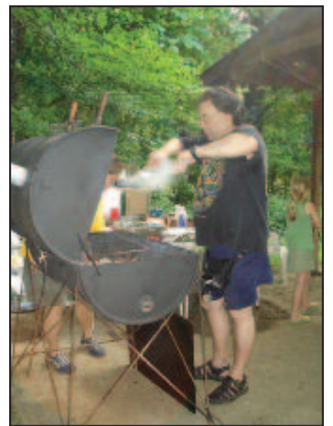
The cook (and author) at the grill.

Cooking three meals a day for 20 to 30 people, plus squeezing fresh lemonade and preparing desserts is no easy chore. I spend most of my time near the kitchen area chopping vegetables, checking on ice, and all the other little things to keep the kitchen running smoothly. As hikers and volunteers came and went I had an opportunity to talk with them and hear about life on the trail, their hometowns, why they were hiking, etc. It's not every day that you can chat with people literally from all over the world. I have met thru hikers from Australia, Germany, Israel, the UK, and all over America.