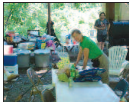
Prepping a meal in the "kitchen."