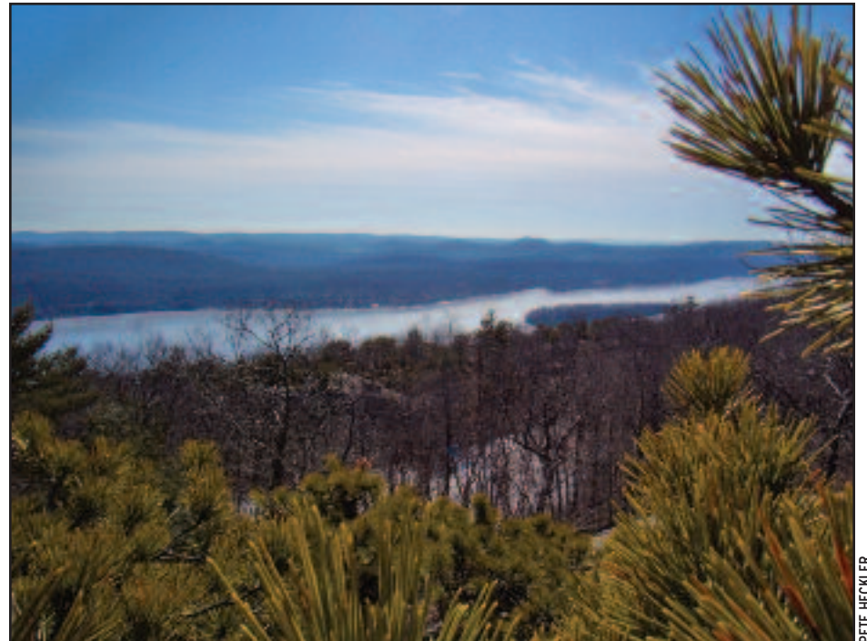
View from the Quail Trail, also known by some as the Jeremy Glick Trail, on the Bearfort Ridge in New Jersey.

WTA. Ringwood-Ramapo, NJ. Leader: Eileen West, eileenw1000@yahoo.com . Meet: 9:15am at North White Plains Train Station parking lot and carpool to the hike site. 8 miles, moderate. Explore the ridges and valleys of the Ringwood-Ramapo forests, topped off by a stroll through Skylands (New Jersey Botanical Gardens). Lunch at the view on Ilgenstein Rock; one afternoon break on Mt. Defiance and another among the garden flowers. Rain cancels. Transportation contribution, $4.